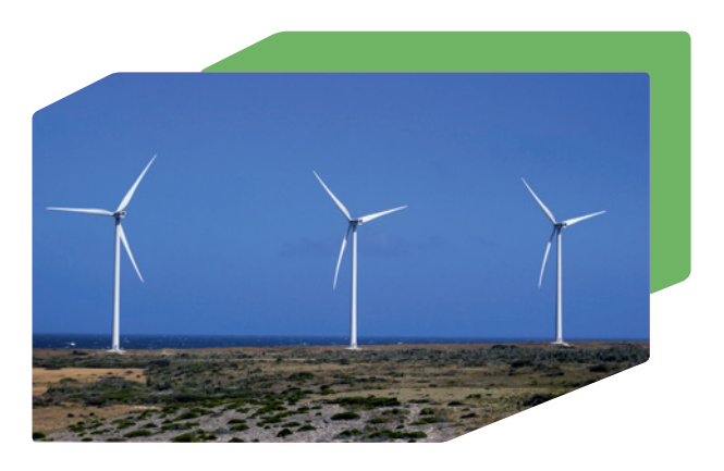
Wind energy is green: Carbon offset project in Vader Piet, Aruba

When setting the manufacturing of production printing devices carbon neutral, we support a Certified Emission Reduction (CER) project in Liaoning, China. In the coal mining area, large amounts of emitted methane gas have been extracted from underground boreholes for maintaining safety in the coal mine. This gas is collected and reused in the region.